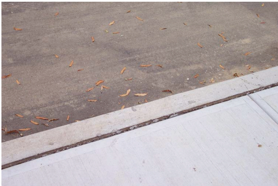
Curb across from the parking spaces